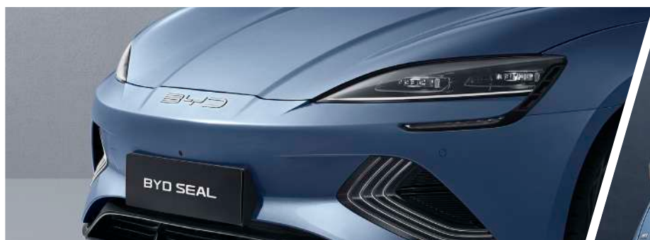
Crystal LED Combination Headlights