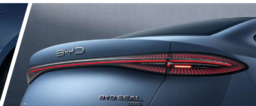
Boundless One-piece Through LED Taillight