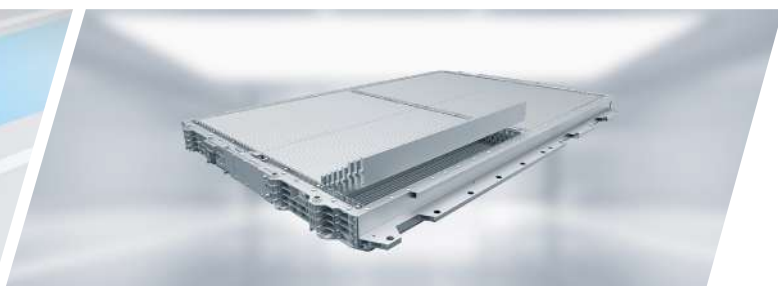
BYD Blade Battery